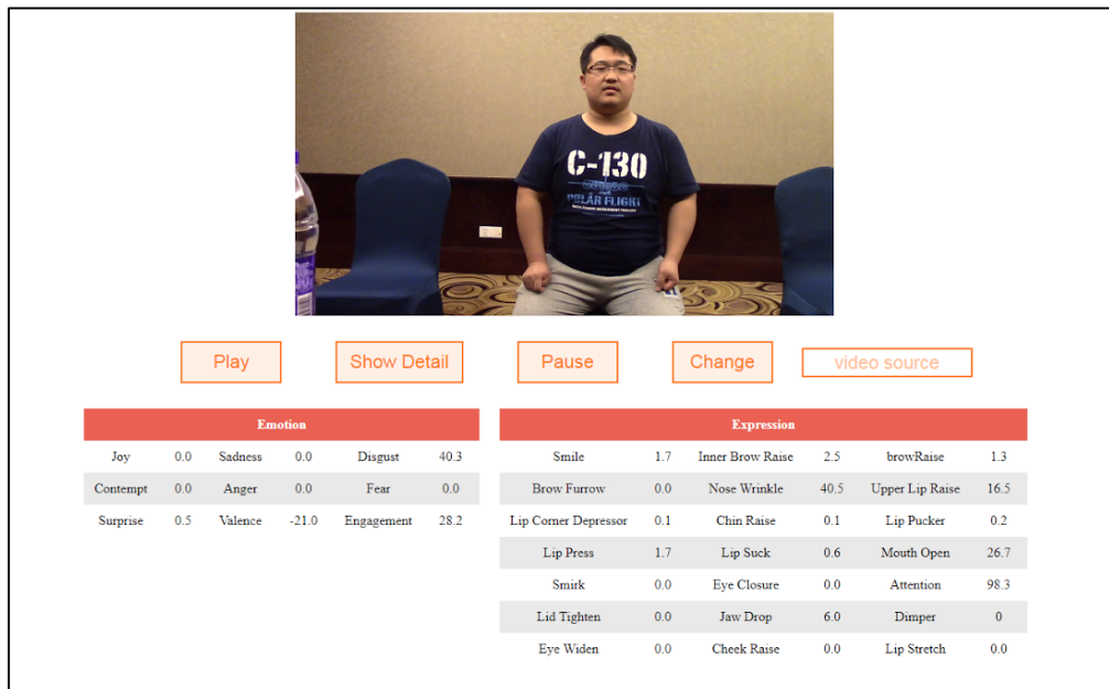
Figure 2 Visual data analyzing system

information, e.g., emotions and facial expressions. The information generated are shown in the web interface in real-time for users to keep track of the changes in the interviewee's emotion and facial expression (See Figure 2).