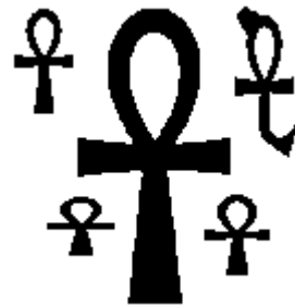
Figure C.3: AAAAA