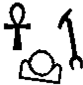
Figure C.2: AKW

The sample input contains descriptions of test cases shown in Figures C.2 and C.3. Due to space constraints not all of the sample input can be shown on this page.