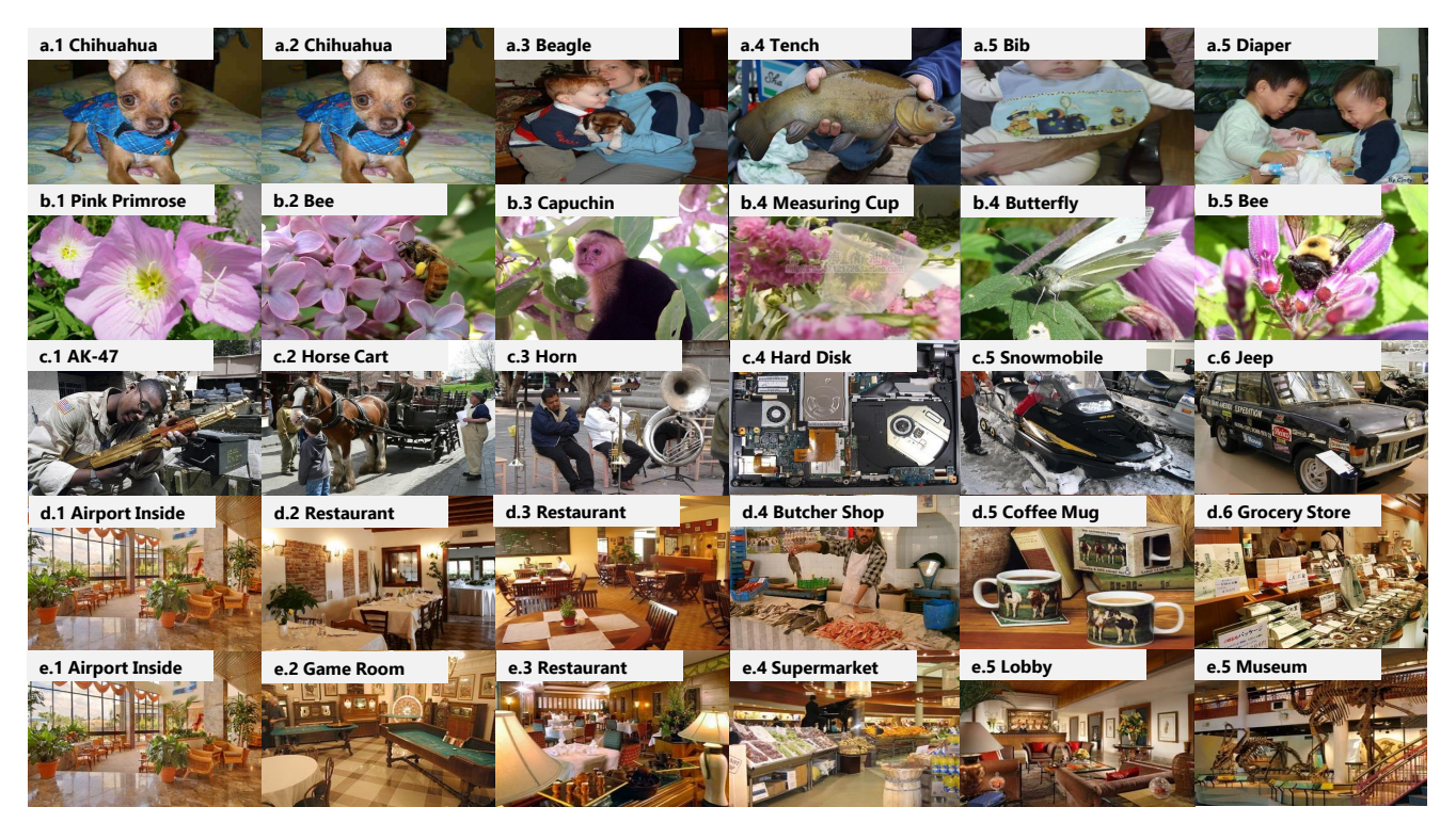
Figure 2. Images in the source domain that have similar low-level characteristics with the target images. The first column shows target images from Stanford Dogs 120 [19], Oxford Flowers 102 [29], Caltech 256 [11], and MIT Indoor 67 [33]. The following columns in rows (a)-(d) are the corresponding 1st, 10-th, 20-th, 30-th and 40-th nearest images in ImageNet (source domain). The following columns in row (e) are images retrieved from Places (source domain for MIT Indoor 67).

local patterns and global structures. Since low-level filter bank responses do not encode strong semantic information, the 50 nearest neighbors from a target domain include images from various and sometimes completely unrelated categories.